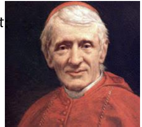
St John Henry Newman

If you ask me what you are to do in order to be perfect, I say, Do not lie in bed beyond the due time of rising; give your first thoughts to God; make a good visit to the Blessed Sacrament; say the Angelus devoutly; eat and drink to God's glory; say the Rosary well; be recollected; keep out bad thoughts; make your evening meditation well; examine yourself daily; go to bed in good time, and you are already perfect.